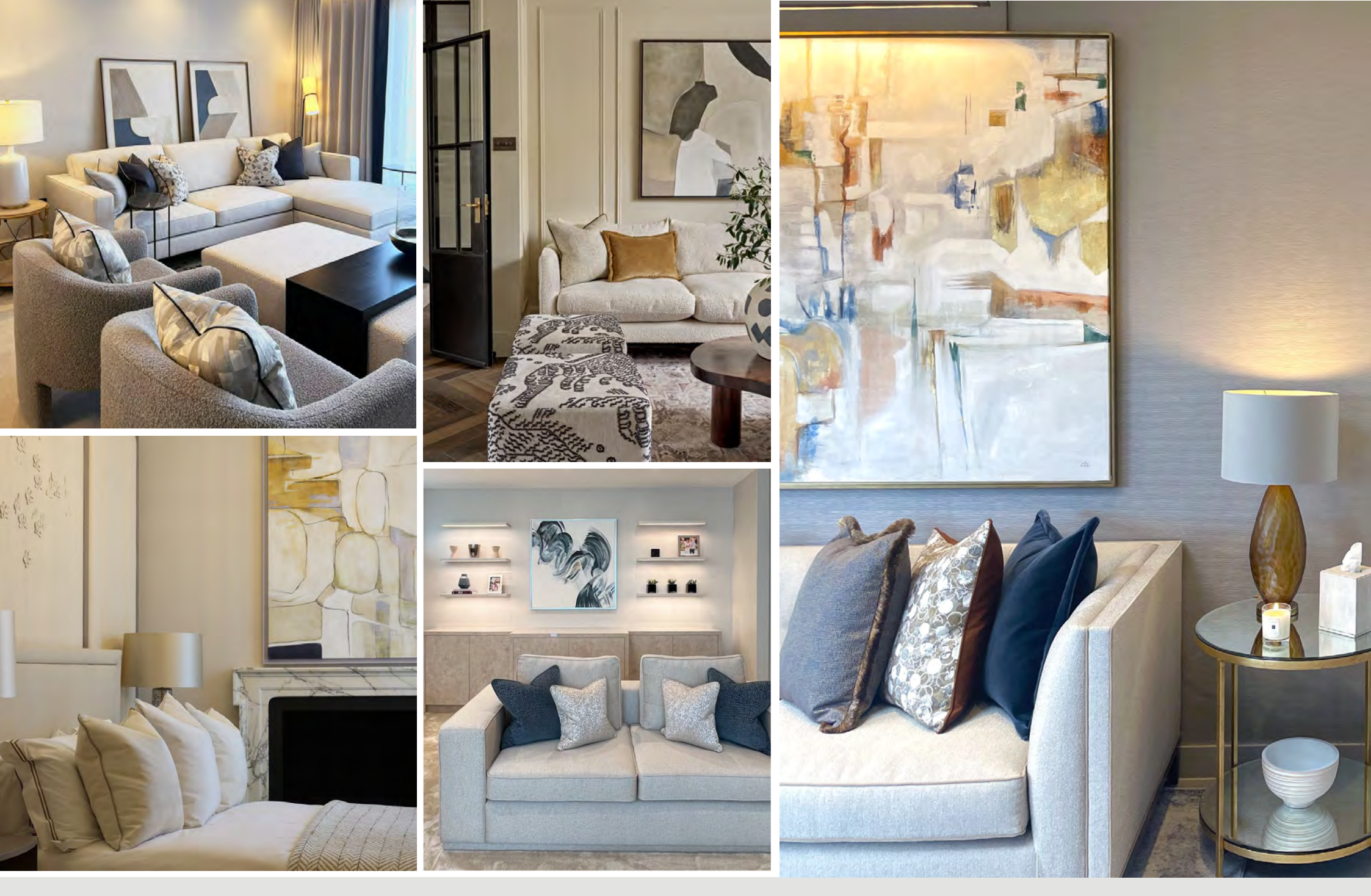
Top left: Shonta // Bottom left: Almandi