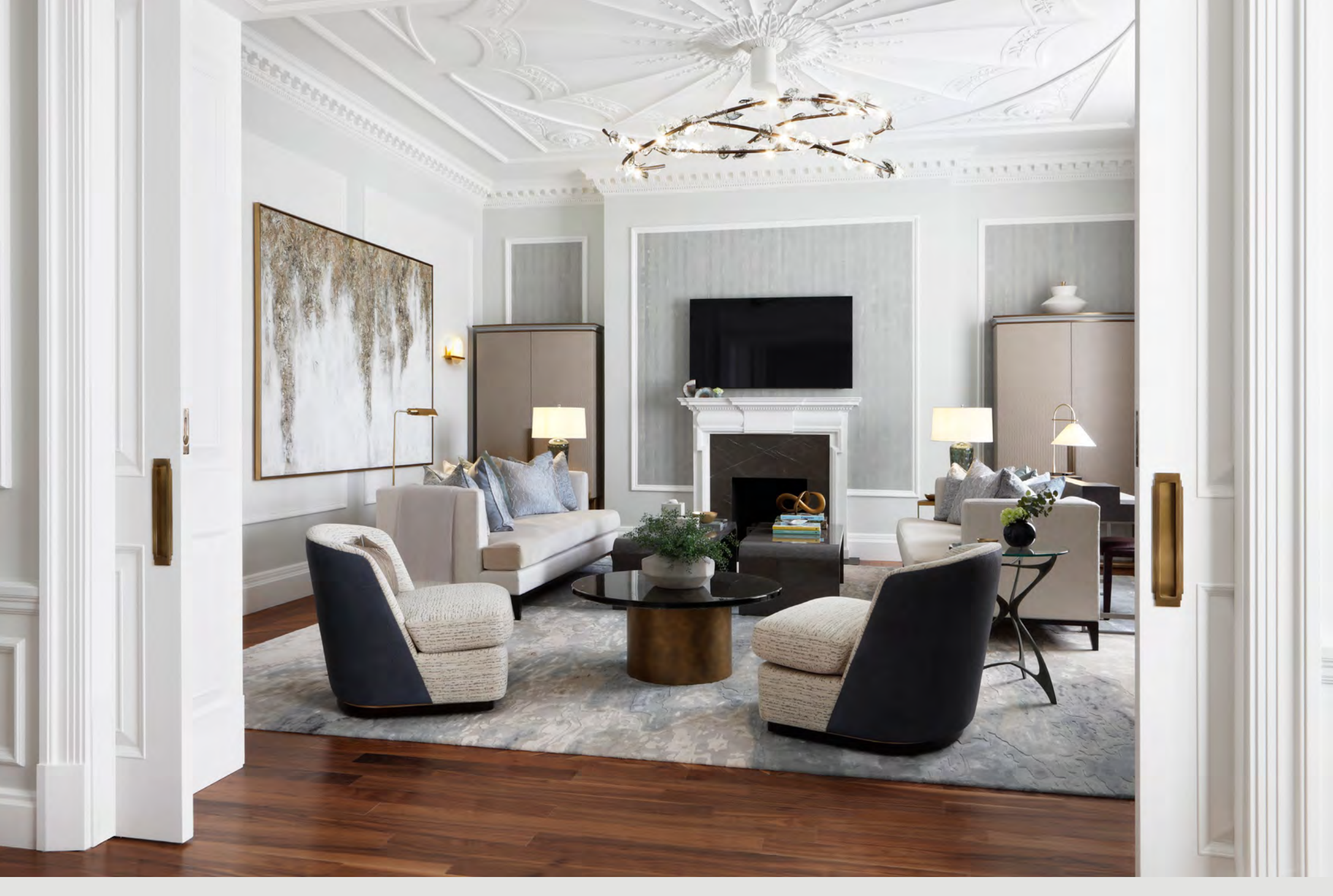
Artwork featured: Peial // By kind permission of Helen Green Design