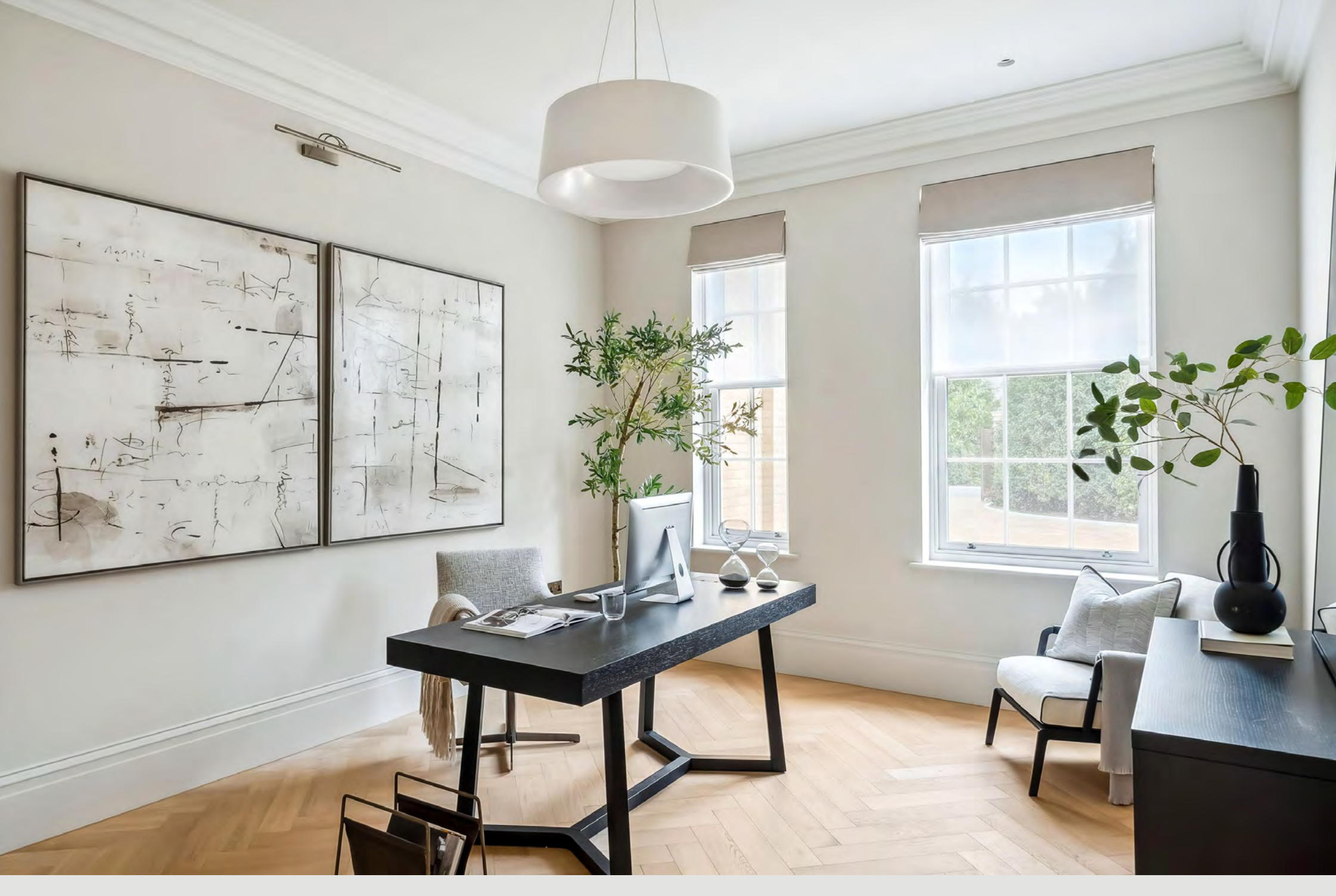
Artwork featured: Coria