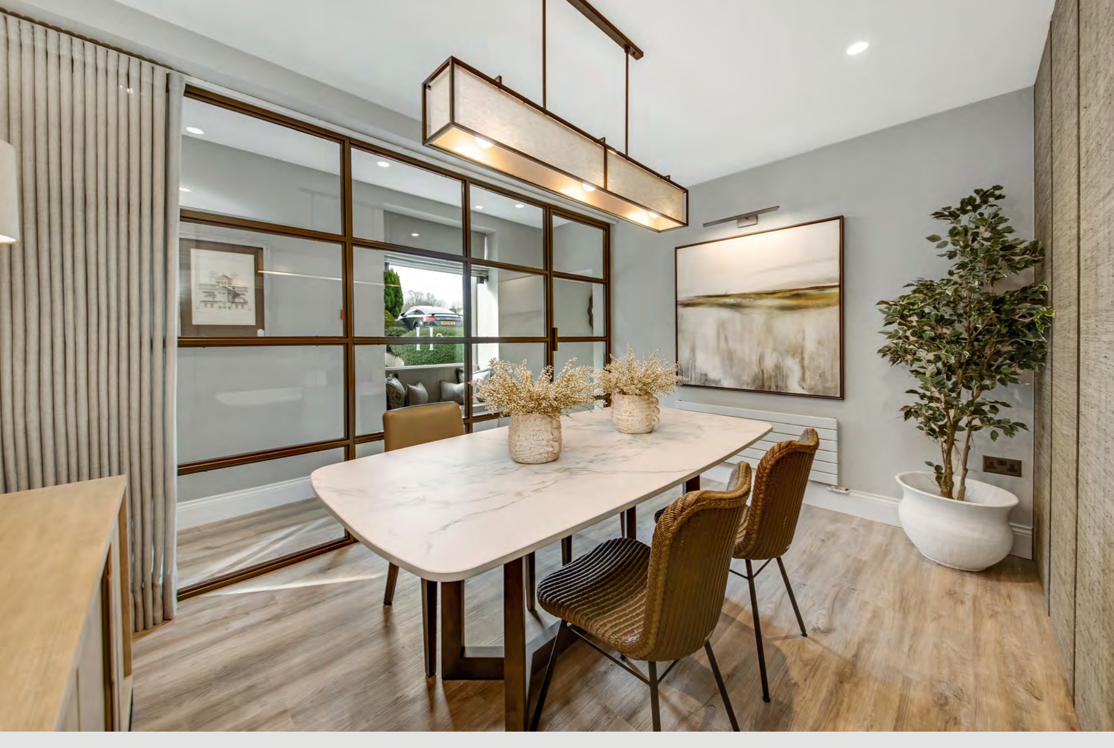
Artwork featured: Flike // By kind permission of Harpers Interiors