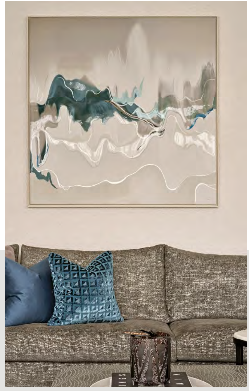
Artwork featured: Nito, Custom colour // By kind permission of Sable Interiors