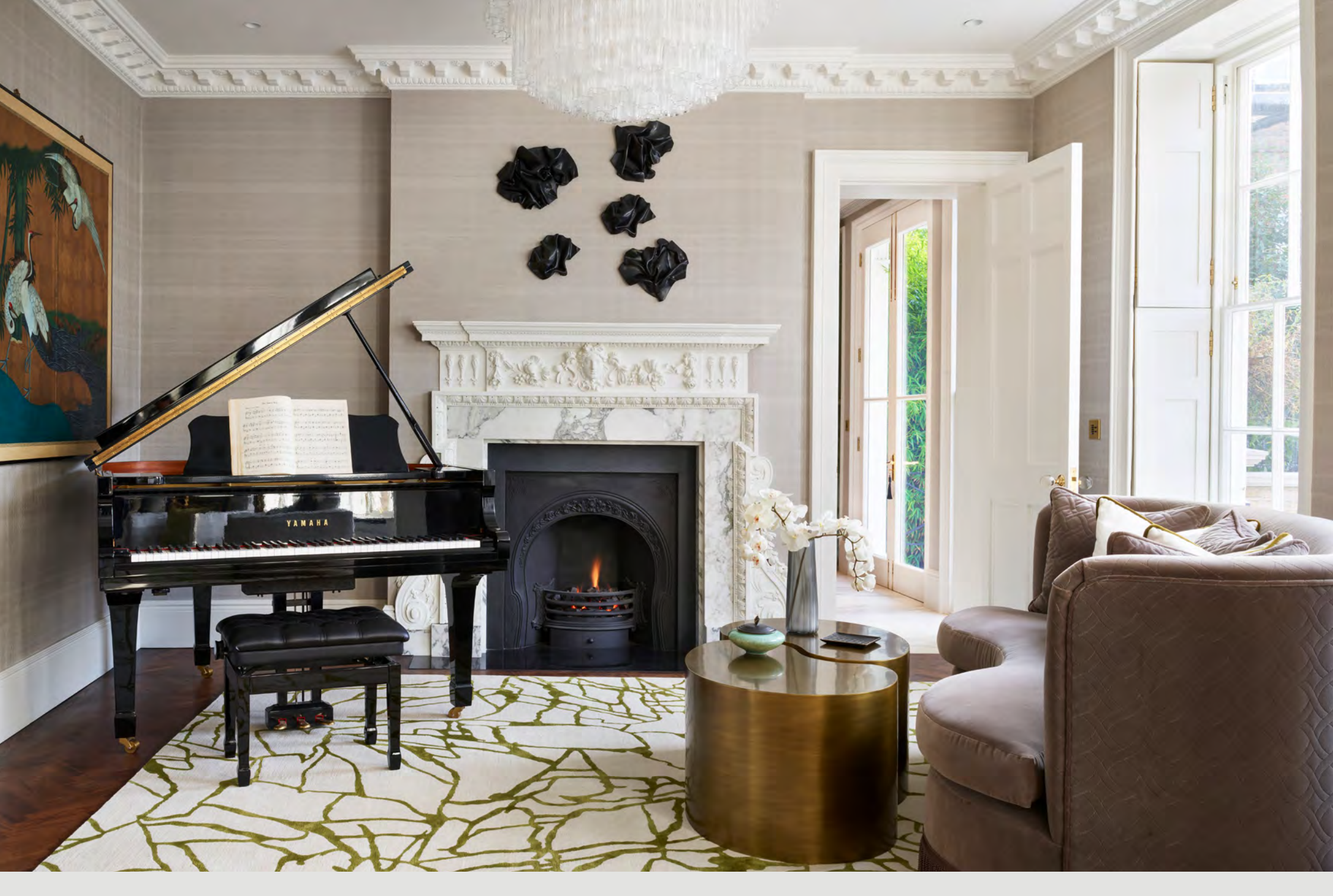
Artwork featured: Crunchie, wall sculptures in a custom finish. // By kind permission of Hamilford Design