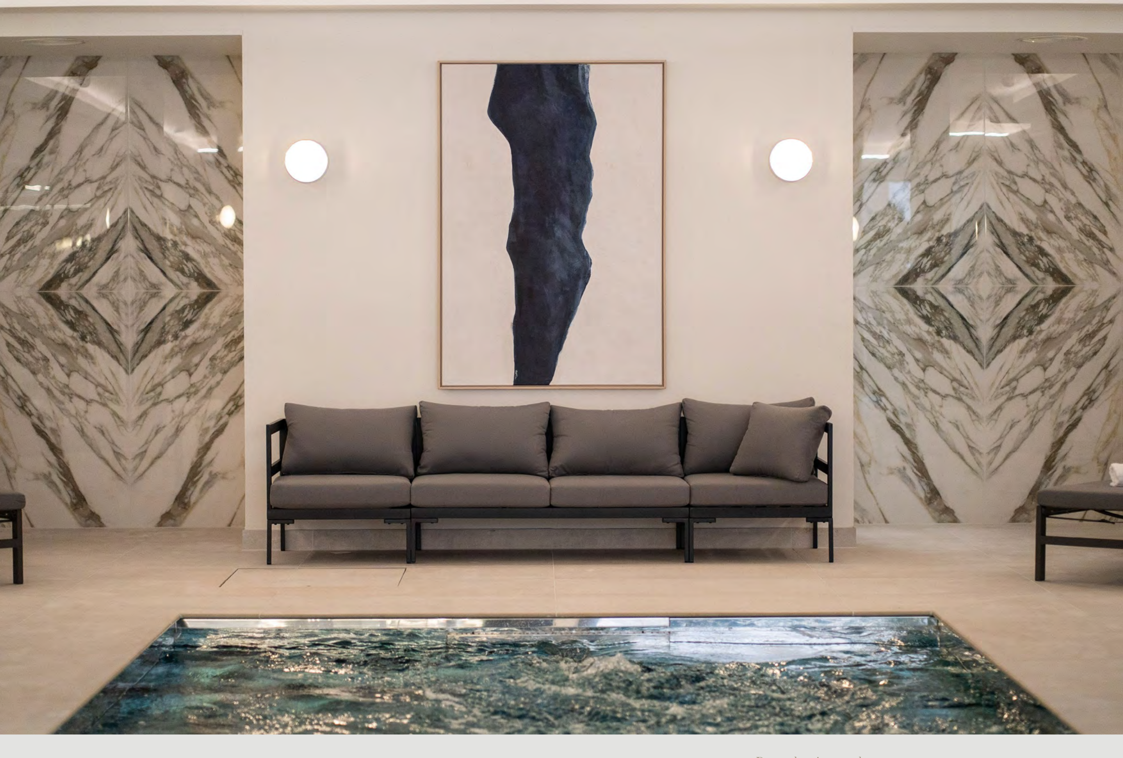
Bespoke Artwork By kind permission of Camerich