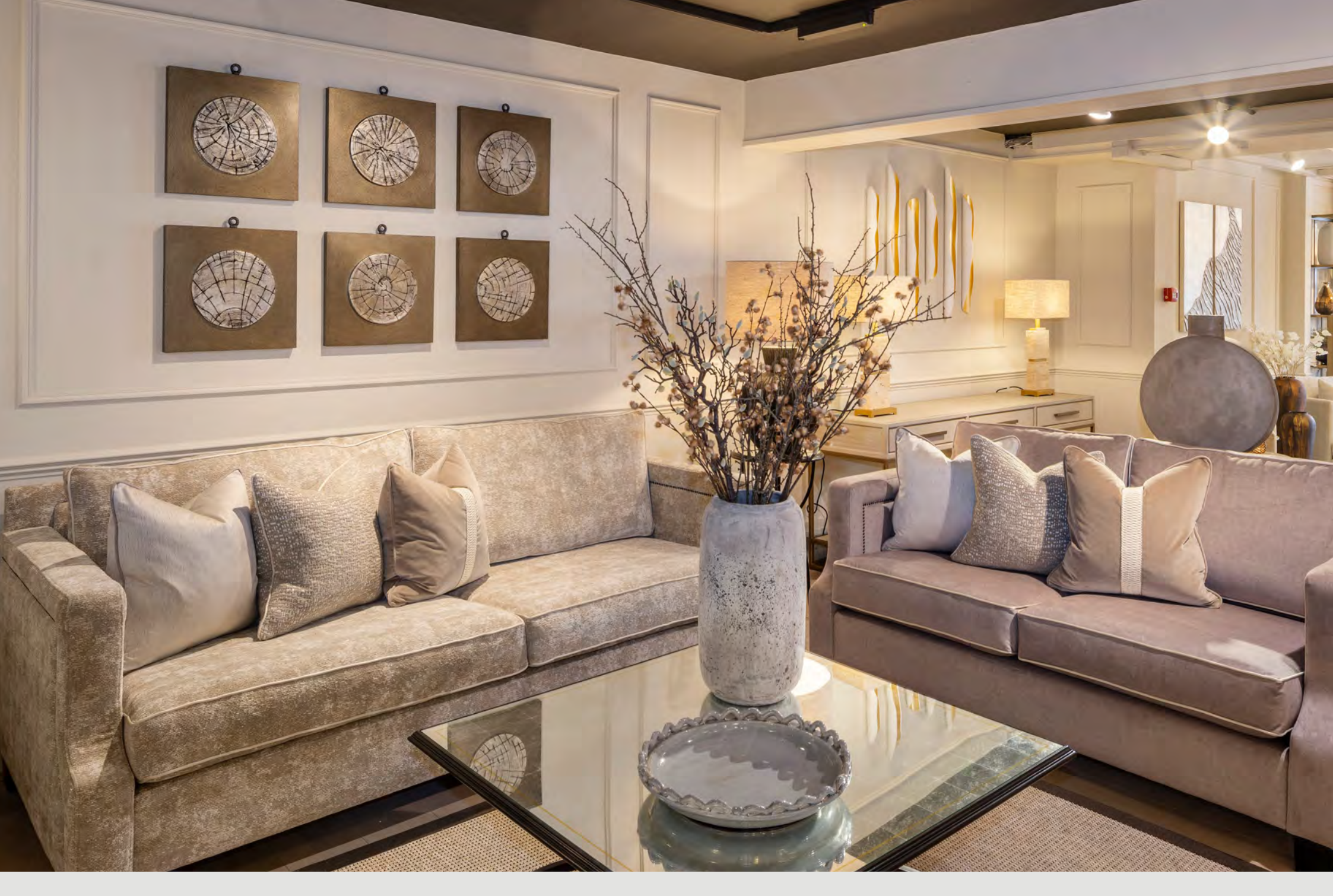
Artwork featured: Bark Bats, Ericus wall sculptures, Seashore // By kind permission of Knights of Beconsfield