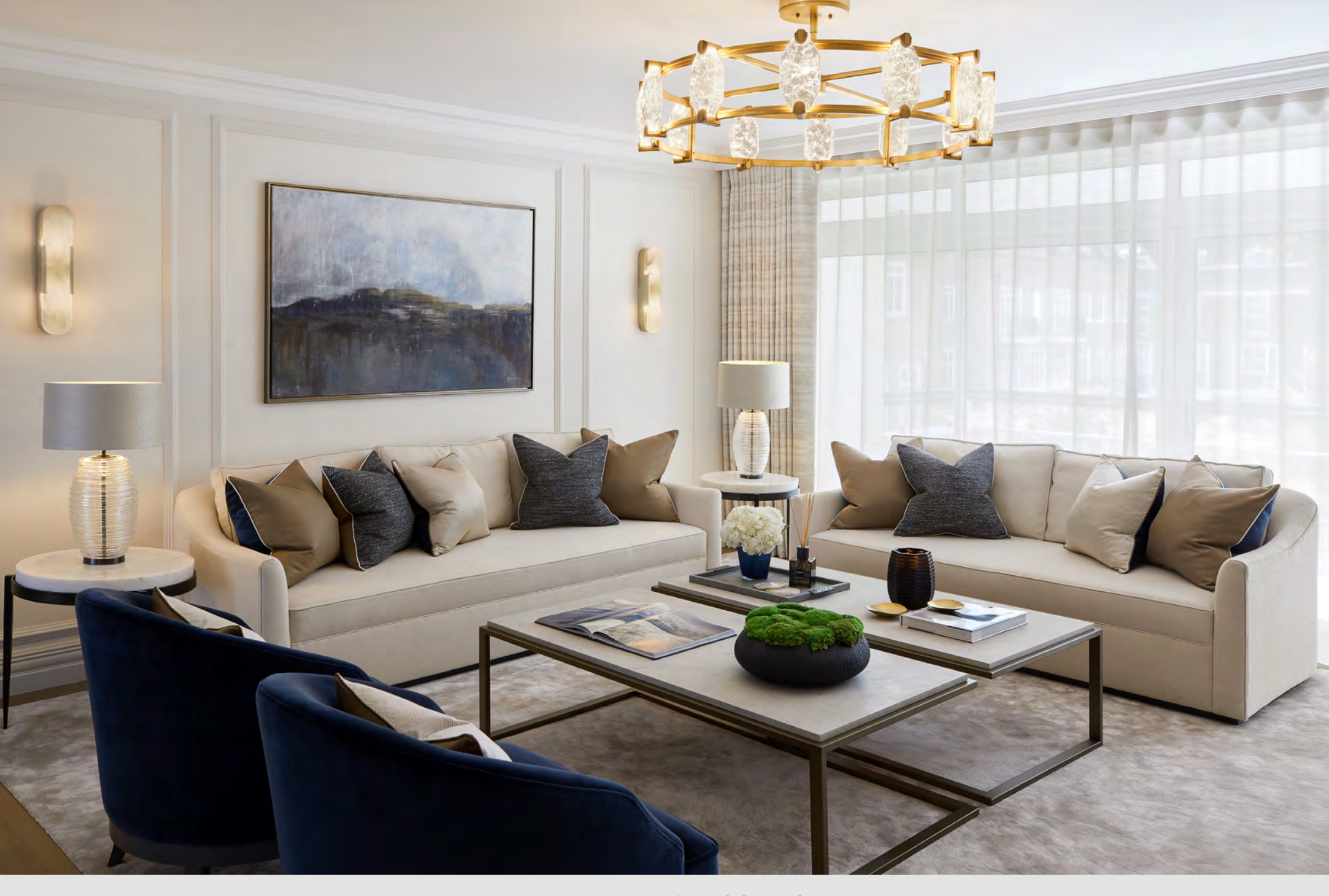
Artwork featured: Barca, Custom colouring // By kind permission of Rachel Winhan Interior Design