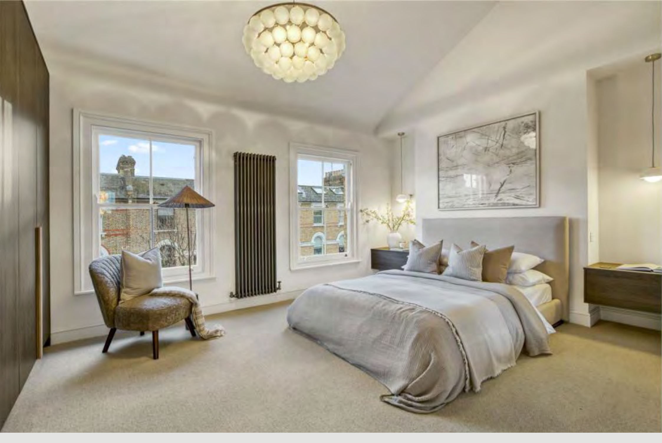
Artwork featured: Cirrit // By kind permission of Camerich