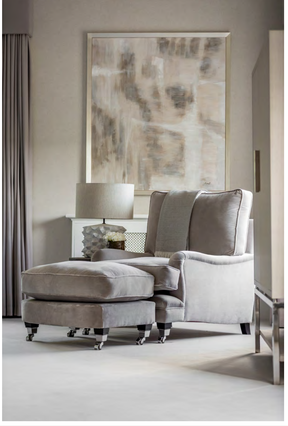
Top left: Peial, By kind permission of Sixty3 London // Bottom left: Pebbi, By kind permission of Laura Sole Interiors // Centre top: Cupolo Fine art Prints, By kind permission of Camerich. // Centre bottom: Bespoke, By kind permission of Amailia Boier // Right: Astrov, By kind permission of Websters Interiors.