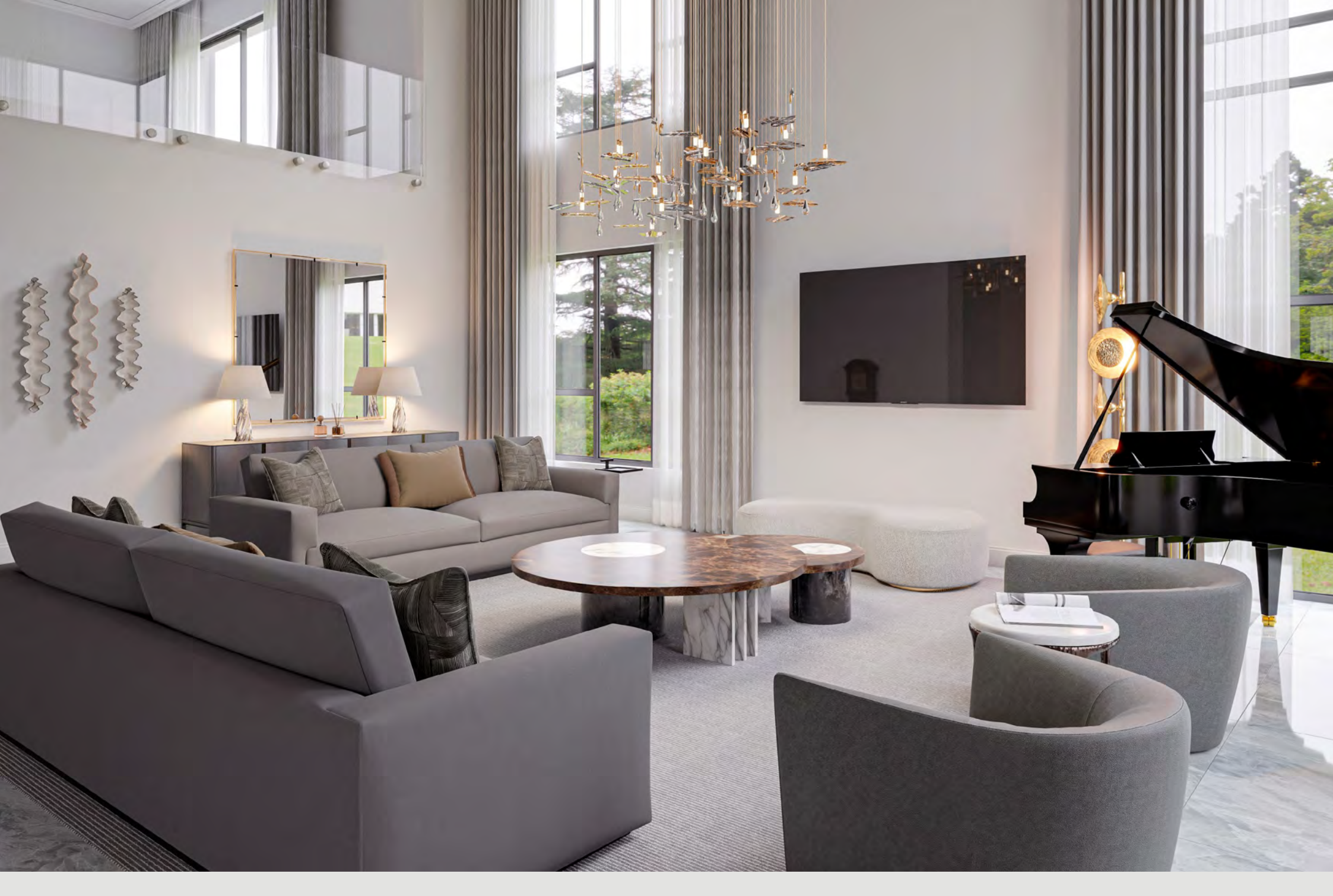
Artwork featured: Mestina, wall sculptures // By kind permission of Maverick London