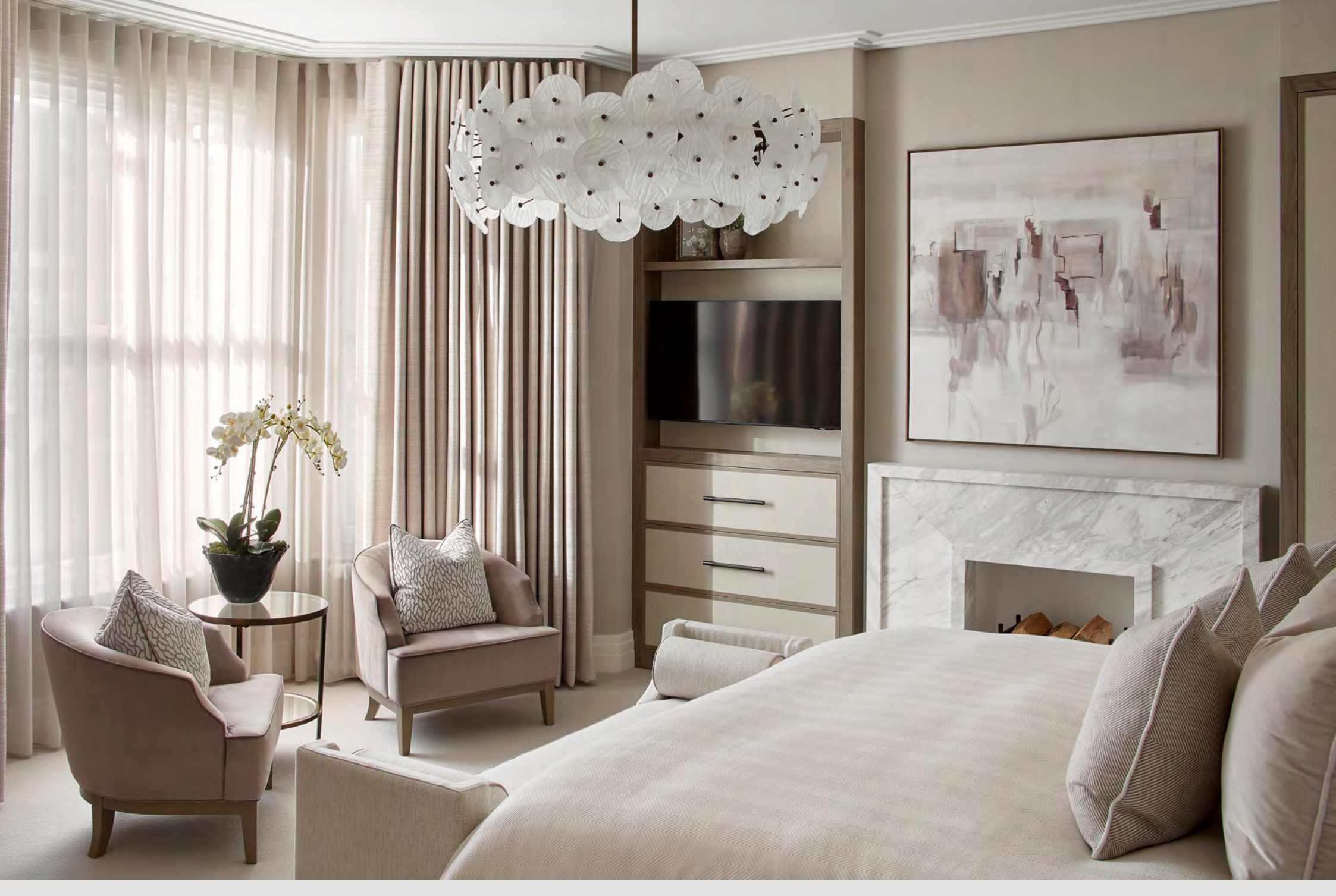
Artwork featured: Studer // By kind permission of Sixty3 London